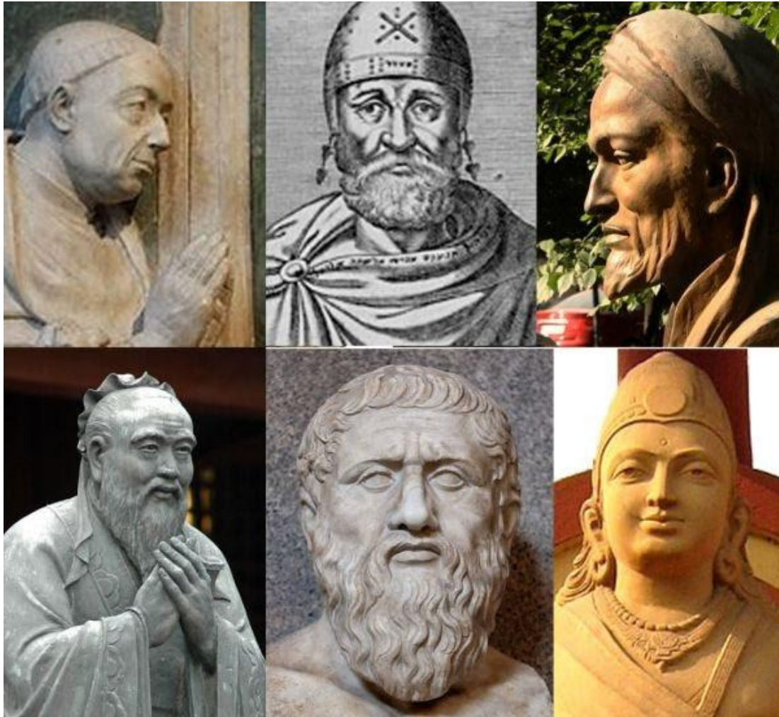
CAPTION: The renaissance principle, whose lawful obedience is so vital for the successful survival of the human species is expressed in every major culture's history at various periods. Several leading representatives are pictured above (top row): Cardinal Nicholas of Cusa, Rabbi Philo of Alexandria, and the Ibn Sina (bottom row): Confucius, Plato and Gupta Empire Leader Chandragupta I.