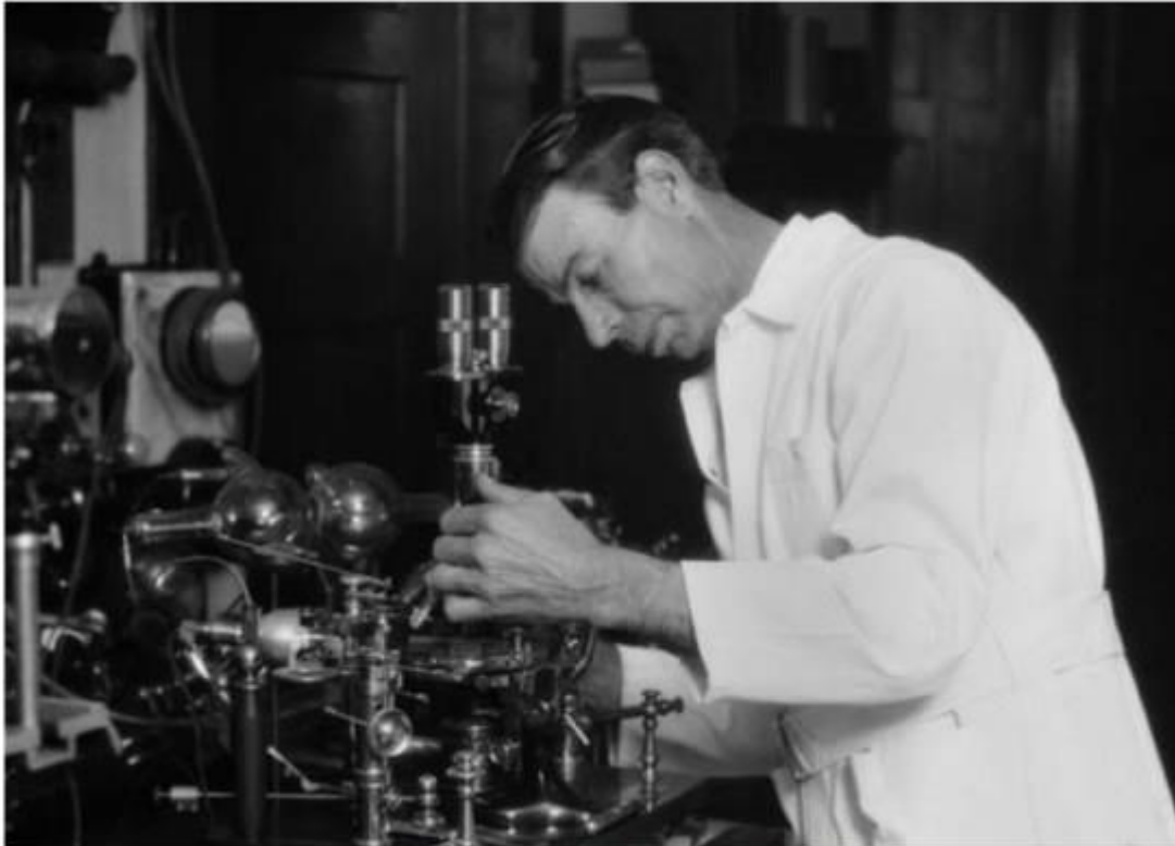
Dr. Rife working on his microscope.