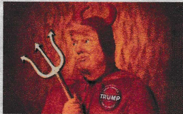
HELL-BENT: How the anti-Trump forces portray the President-elect.

Comments Trump made 11 years ago received top billing on interna-